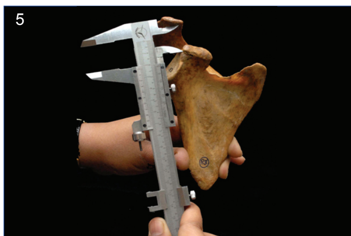
[Table/Fig-5]: Distance between supraglenoid tubercle to acromion process.

as coraco acromial length and acromio glenoid distance (Ac – g dis) as shown in [Table/Fig-1-5].